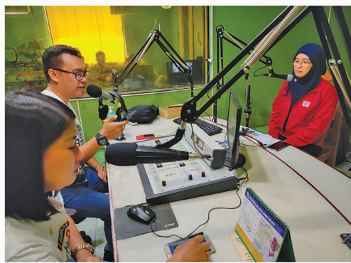
Ikaw ug ang DSWD: Kuyog sa Kabag-uhan Radio Program