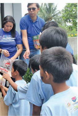
Giving- August 22