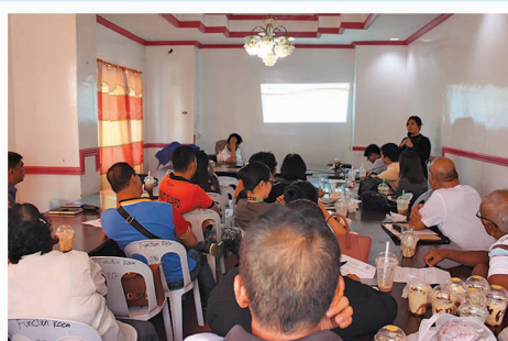
CCAM LGU Orientation (Socorro, SDN) - August 15