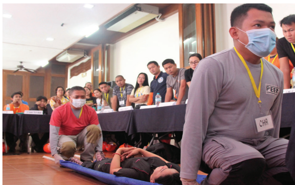
Participants attentively observe as CADRE instructors demonstrate on how to make an improvised stretcher.

This lectures were revalidated thru an actual simulation of all the CADRE topics that were discussed. The participants had to go through the basic CADRE training for them to fully understand the need and importance of TeamBRE project to the community. Since they were expected to advocate and lead in the replication of the project to their specific regions, each Field Office had to prepare their action plan, specific for application in their respective regions.