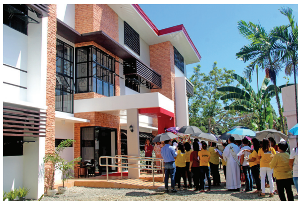
Present during the inauguration are different stakeholders and partners in delivering social and legal services to the clients of the Home for Girls.