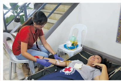
Bloodletting Activity - July 2