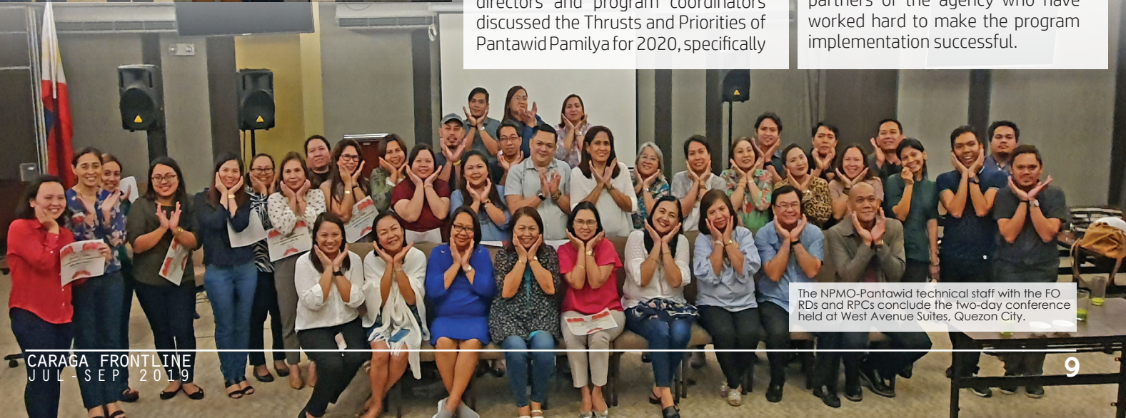
The NPMO-Pantawid technical staff with the FO RDs and RPCs conclude the two-day conference held at West Avenue Suites, Quezon City.

DSWD-Caraga would like to share the different awards and recognition to the Pantawid Pamilya regional workforce and to the different partners of the agency who have worked hard to make the program implementation successful.