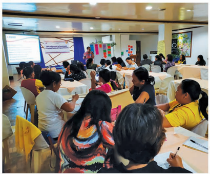
Skills Enhancement for Parent Leaders of Pantawid Pamilya as Program Advocates - July 31