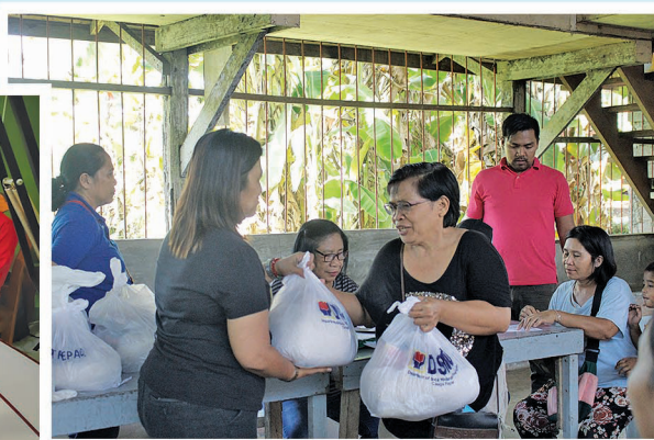
Relief Assistance to 5.5 magnitude Earthquake-affected families in Madrid, Surigao del Sur - July 18