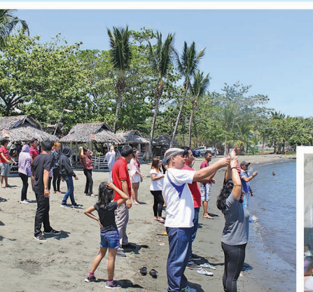
DSWD Family Day in Nasipit - September 27