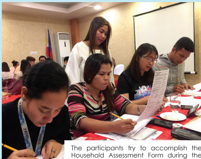
The participants try to accomplish the Household Assessment Form during the 2nd day of Regional Training of Trainers.