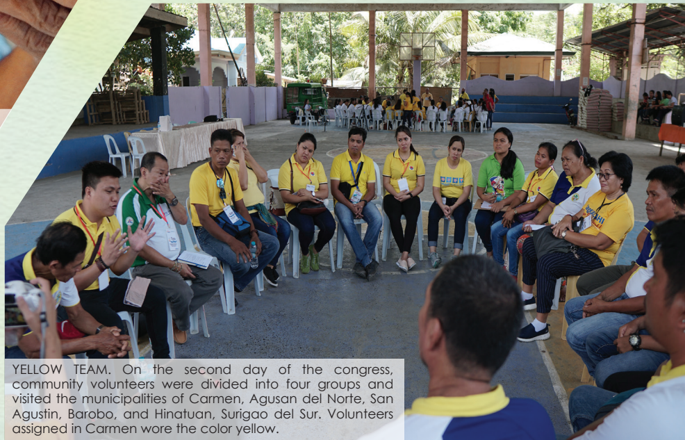
YELLOW TEAM. On the second day of the congress, community volunteers were divided into four groups and visited the municipalities of Carmen, Agusan del Norte, San Agustin, Barobo, and Hinatuan, Surigao del Sur. Volunteers assigned in Carmen wore the color yellow.

As part of the learning visit, a focus group discussion was conducted involving the delegates and the community volunteers and barangay-level leaders. The discussion was focused on the challenges encountered by the volunteers and stakeholders in the program implementation and the resolutions they came up with, the influence brought by the program in their lives, and the impact made by the Community-Driven Development approach in their communities.