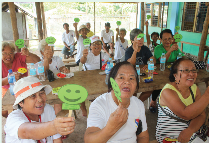
Social Pension beneficiaries of Barangay Crossing, Kitcharao, Agusan del Norte, participate in the focus group discussion conducted by ICI-Asia, a firm commissioned by the World Bank to conduct study on DSWD's Social Pension for Indigent Senior Citizen Program, last June 25, 2019.