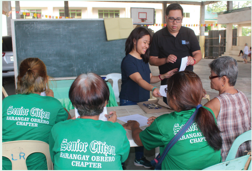
ICI-Asia researchers conduct focus group discussion with senior citizens in Barangay Obrero, Butuan City on June 24, 2019

Cited as one of the best field offices in the country when it comes to management of social pension, the Department of Social Welfare and Development (DSWD)-Caraga was selected by the World Bank as one of its subjects of study on the Social Pension for Indigent Senior Citizens Program (SocPen) implementation.