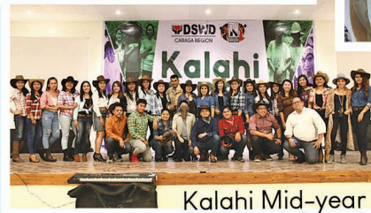
Kalahi Mid-year PREW - July 4-5