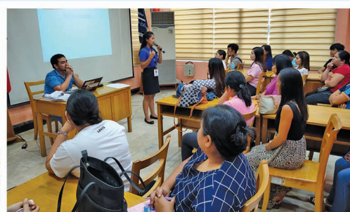
Listahanan 3 Orientation - August 19