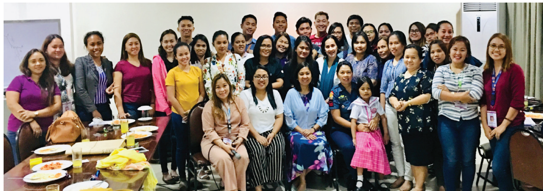
The first batch of participants on the first-ever paralegal training last July 11-13 at Dotties Place, Butuan City.

An action plan and evaluation was done to formally close the three-day training. At least 40 field workers have participated and a second batch is expected next week.