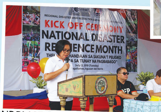
NDRM Kick-Off Ceremony - July 2