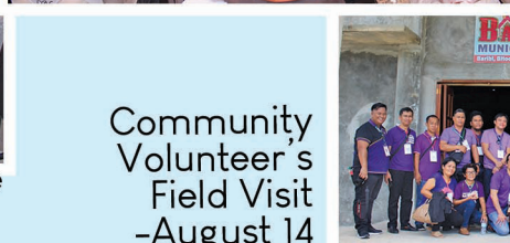
Community Volunteer's Field Visit -August 14