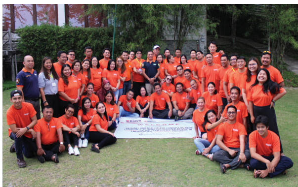
The second batch of participants of the National Orientation and conduct of Basic Community Action for Disaster Response (CADRE) on the Team Balikatan Rescue in Emergencies (TeamBRE) project held in Caraga region.