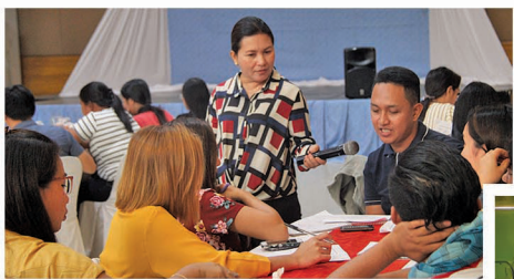
Regional Inspection Committee Members' Orientation on SFP - July 12