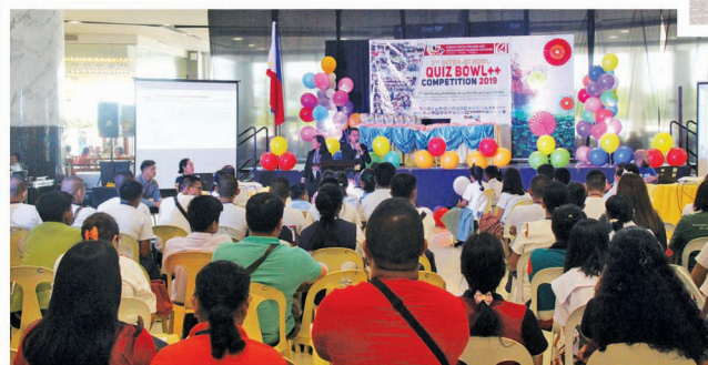
SWD L-Net QuizBowl ++ -Sep 27