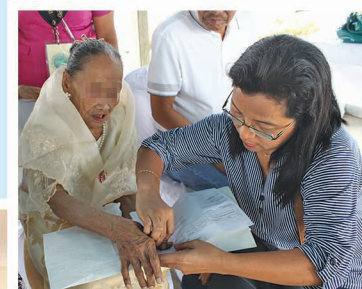
Centenarian Gift (Cash Incentives) - July 17