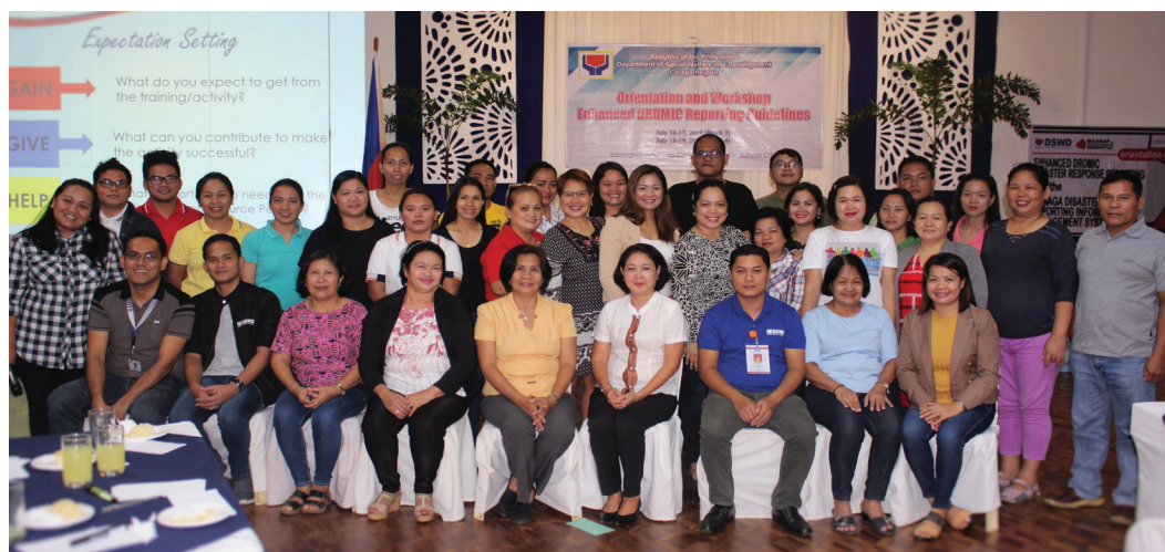
Group photo of the participants from different municipalities of Caraga region.

The Department of Social Welfare and Development (DSWD) Caraga, through the Disaster Response and Management Division (DRMD) concluded its Orientation and Workshop on Enhanced DROMIC Reporting Guidelines last July 20, 2019 at the Balanghai Hotel and Convention Center, Butuan City.