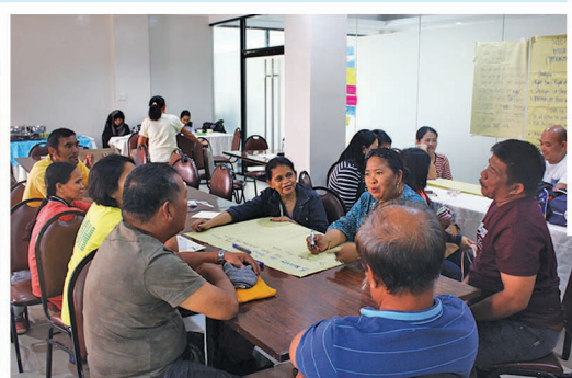
Capability Activity for Adoptive and Foster Parents- August 24