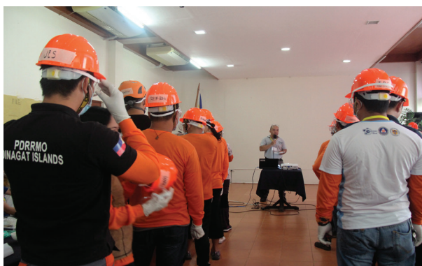
Participants getting ready for the simulation activities after the lecture.