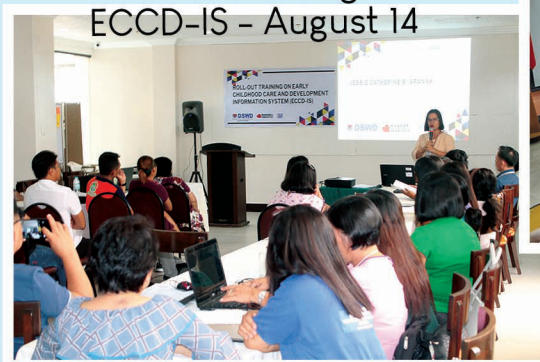
Roll-out Training on ECCD-IS - August 14