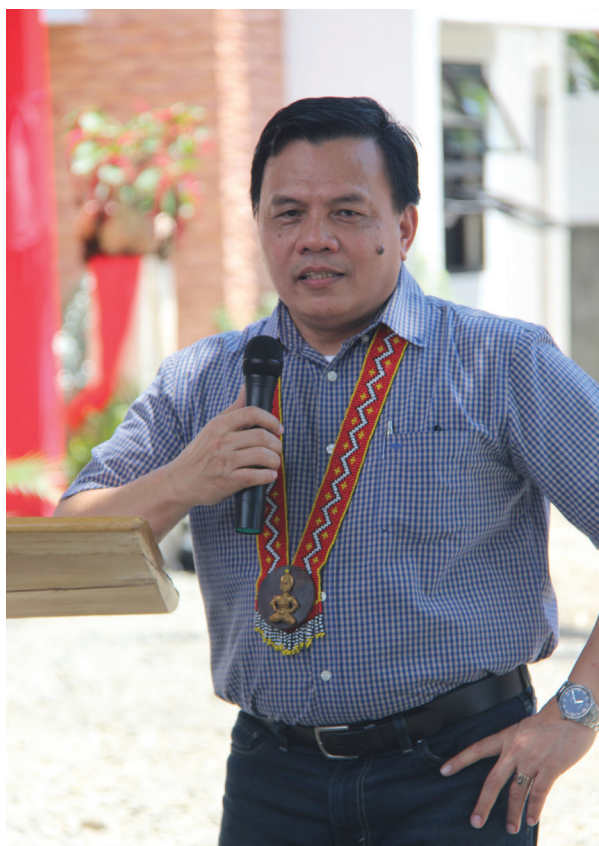
Usec. Gudmalin underscores the importance of creating a better space for children in need of special protection to make their stay in DSWD as comfortable as possible.