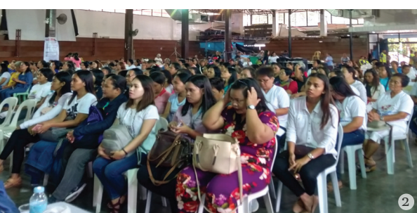
1. SLP as imagined by one of the participants of the poster-making contest held during the said activity.