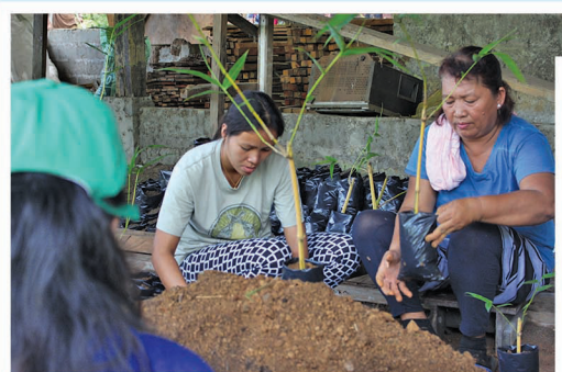
CCAM Implementation in Brgy. Puyat, Carmen, Surigao del Sur - Sep 4