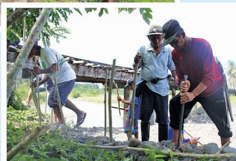
CCAM Implementation in Surigao del Sur - Sep 4