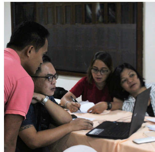
DSWD-Caraga staff assists participants on the proper operation of the online system during the workshop on Enhanced DROMIC Reporting Guidelines.

As member agency of the Disaster Risk Reduction and Management Council (DRRMC), DSWD is likewise charged as vice chair for disaster response and the lead of the DRRMC Response Pillar.