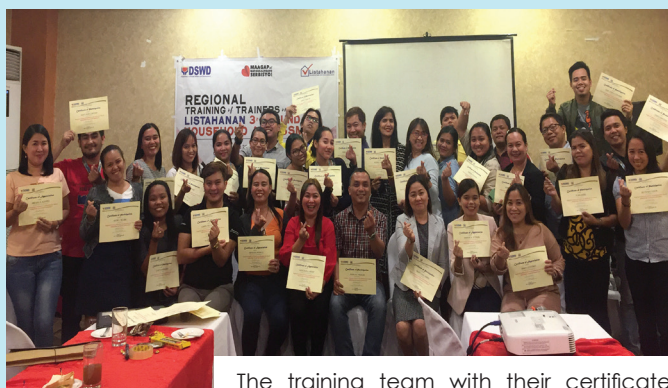
The training team with their certificate as they completed the 3-day training for Listahanan 3.

Other preparatory activities to be conducted by the region office is the conduct of the LGU Consultation Dialogue per cluster, which will be attended by City/Municipal/Barangay Officials, Local Social Welfare and Development Officers, Provincial/Municipal Planning and Development Officers, and Liga ng mga Barangay President. This activity will serve as venue to strengthen partnership and to get 100% support from LGUs in order for the department to successfully implement the Listahanan 3.