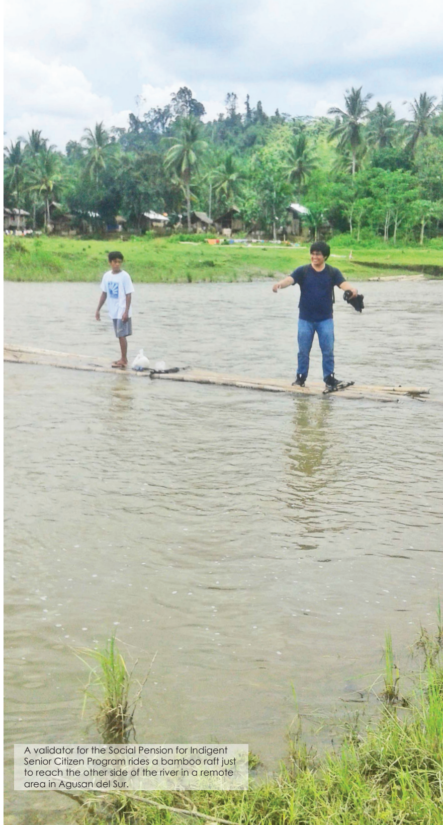
A validator for the Social Pension for Indigent Senior Citizen Program rides a bamboo raft just to reach the other side of the river in a remote area in Agusan del Sur.